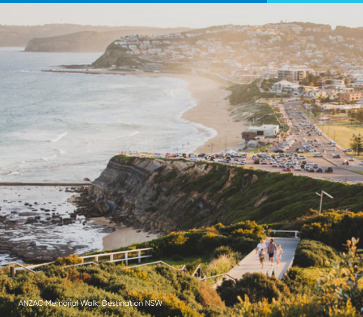
ANZAC Memorial Walk

Explore Newcastle's stunning coast line with this self-guided walking tour.