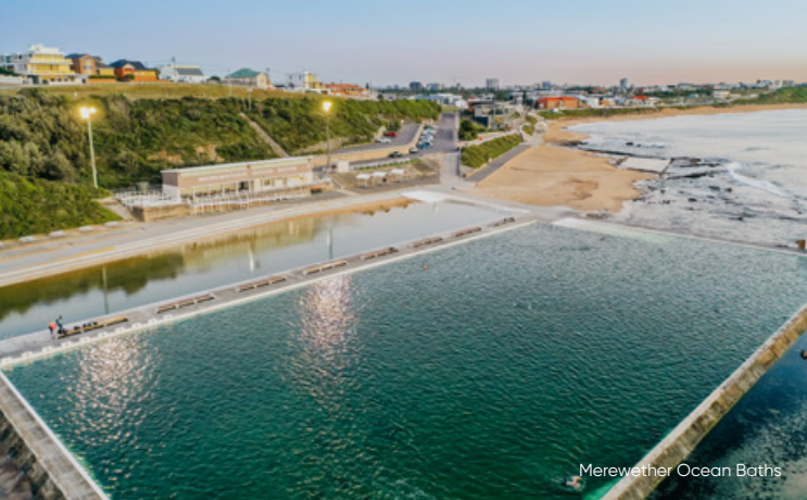
Merewether Ocean Baths