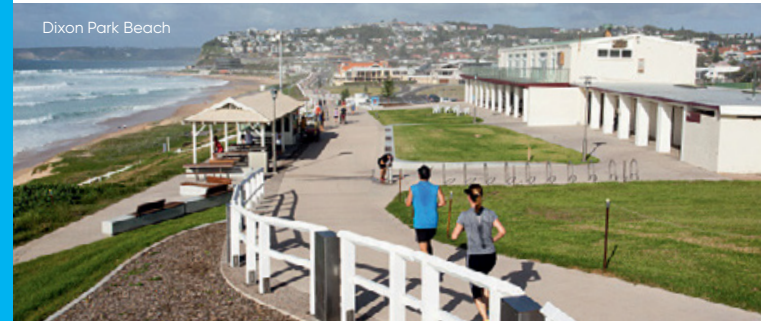
Dixon Park Beach

The beach itself is perfect for swimming and surfing, and has a large park, children's playground, off-leash area for dogs and a kiosk brimming with coffee, toasties, ice-cream and pastries.