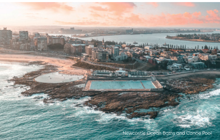
Newcastle Ocean Baths and Canoe Pool

Experienced surfers looking for a reliable reef break should check out the Cowrie Hole just north of the Baths, with the mid tide in autumn and winter the best time to catch a wave.