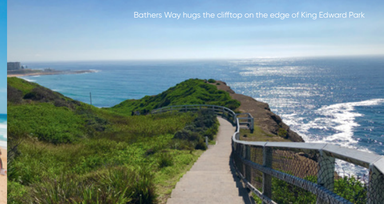
Bathers Way hugs the clifftop on the edge of King Edward Park

Newcastle makes the most of its enviable coastal location with world-class beachside events, from surfing and skating to cultural celebrations and music festivals.