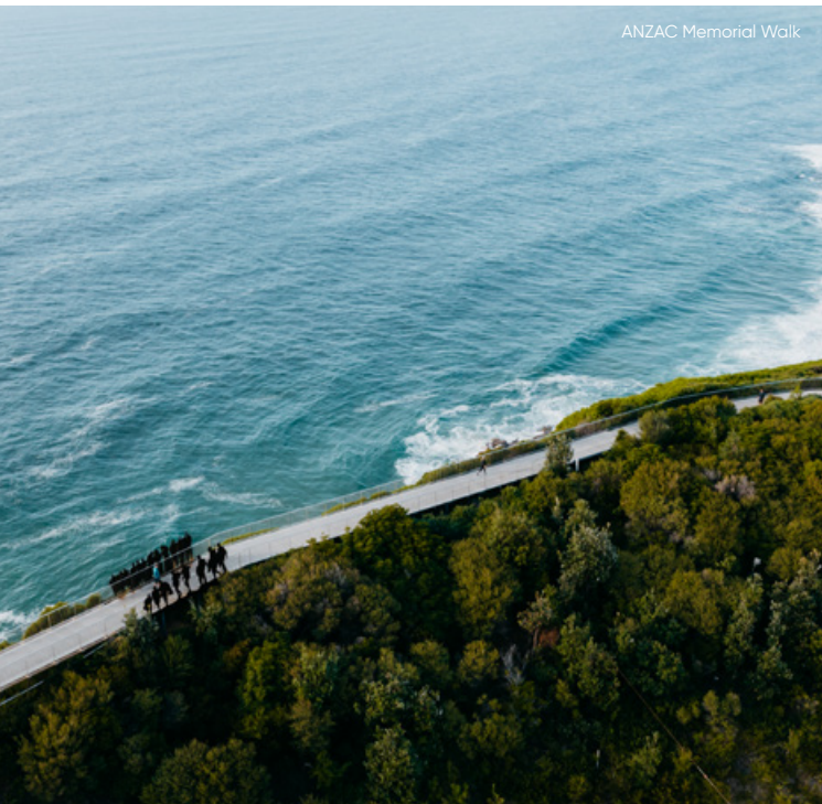
ANZAC Memorial Walk

Starting at Bar Beach, climb the 137 steps to the bridge, or park at Strzelecki for an easier stroll to some of the region's most spectacular city and coastal views.