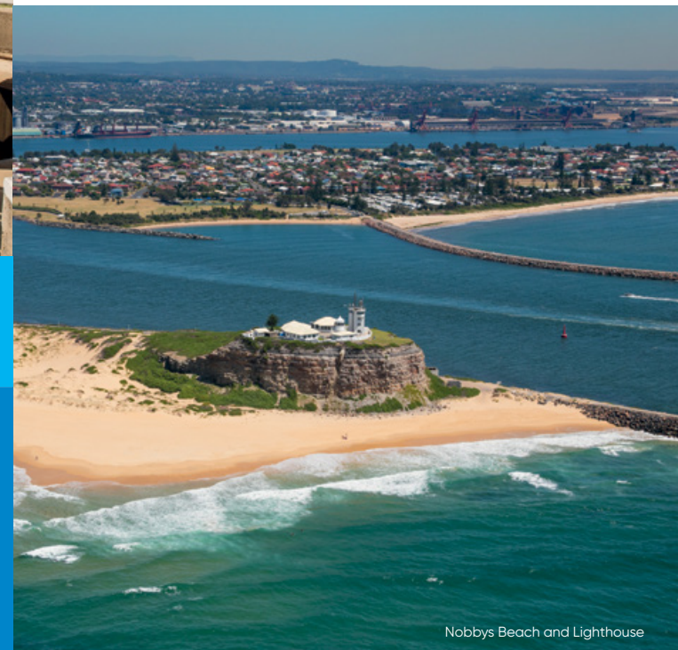
Nobbys Beach and Lighthouse

The beach's south-easterly aspect makes it ideal for families and those learning to surf, while the beach pavilion, with its Art Deco arches and views to Nobbys Lighthouse and beyond, offers a great spot for photography, particularly at sunrise.