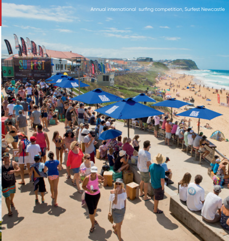
Annual international surfing competition, Surfest Newcastle

? Did you know? Shepherds Hill was originally known to the area's indigenous peoples as Khanterin – you can learn more about its cultural significance from an information board on site.